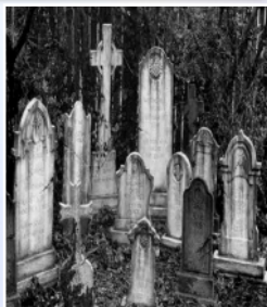
The wicked are asleep in the grave.

2 - The wicked are asleep in the grave and "kn ow not anyth ing ." Their "l ove and their ha red and their en y is now p er ished."