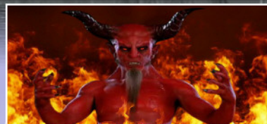
Does he look like this?

*Question: How does the Devil look like?