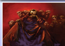
The Greek god Hades

*Note: The Truth is that Satan is a fallen angel from heaven. He still looks like an angel, but has lost much of his beauty from living in rebellion against God. Though, he is no longer the brightest angel, he can "transform himself into an angel of light." -2 Corinthians 11:14