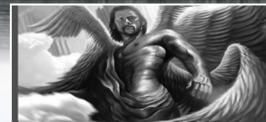
Satan was a fallen angel.

*Answer: It's important to know that the Devil does NOT look like this creature to the left. He does NOT carry a pitchfork, have goat-like features, bat wings, a tail, nor is red. These characteristics were adopted from different pagan myths.