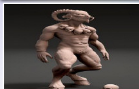
...part goat and part human SATYR and FAUN from Greek and Roman myths.