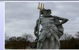
...the pitchfork of the Roman god PLUTO, the god of the underworld.