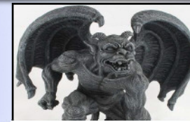
...the bat wings of the GARGOYLES of medieval times.

*Note: The Truth is that Satan is a fallen angel from heaven. He still looks like an angel, but has lost much of his beauty from living in rebellion against God. Though, he is no longer the brightest angel, he can "transform himself into an angel of light." -2 Corinthians 11:14